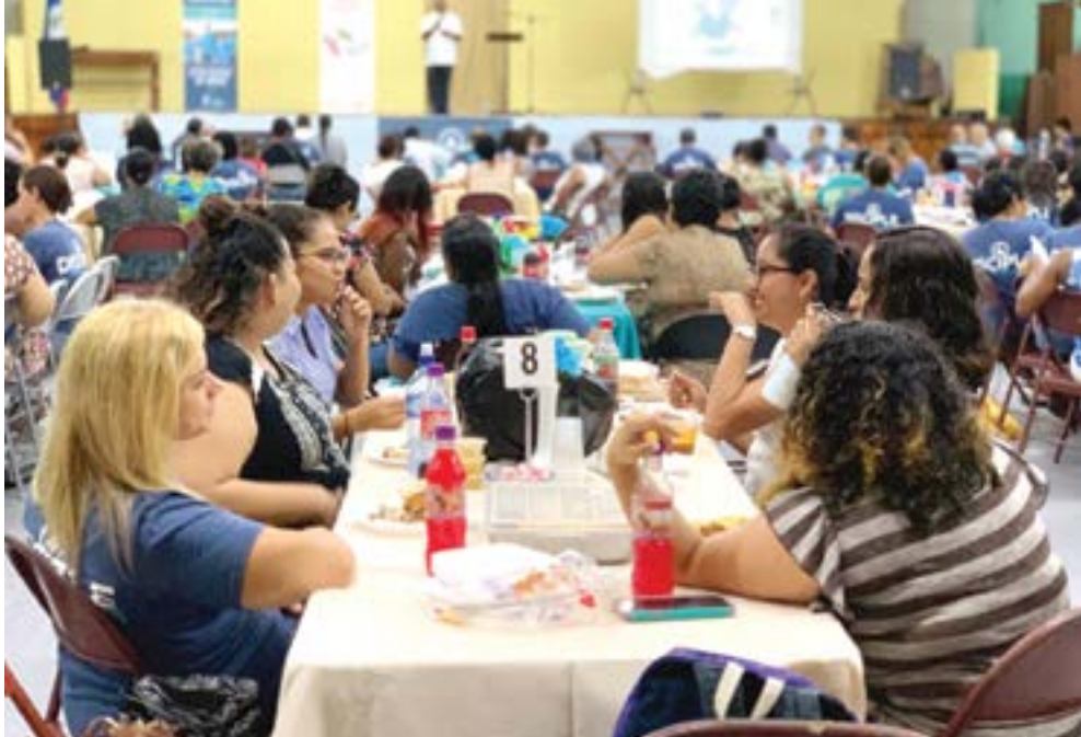
Above: DISCIPLE participants in Phoenix take time on to reflect on scripture in adoration; a table of women in Belize City share in a discussion of that night's presentation.

the transformative power of an encounter with the Holy Spirit. We will invoke the intercession and study the beautiful example of our Blessed Mother Mary, who is the model and perfect disciple.