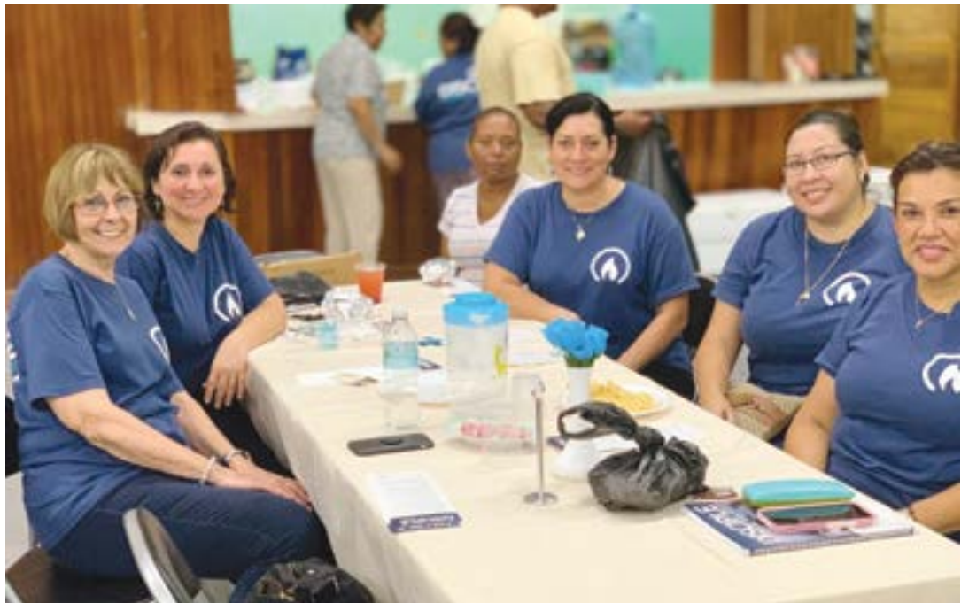
Volunteers at the Divine Mercy parish in Belize City assist in the administration and implementation of the DISCIPLE program.

First, there was a universal recognition of the challenges to listen well to the Holy Spirit amidst the busyness of life, the noise and nonsense of the world around us, and our cultural influence to prefer speaking (or posting) over listening. Indeed, to listen well to the Holy Spirit requires silence, time for reflection and prayer, immersion in the Word of God and liturgy of the Church, and the discernment to hear His voice speaking to us even in the voice of other people. The synod reminded us that it takes an intentional, daily effort to listen well to the Holy Spirit.