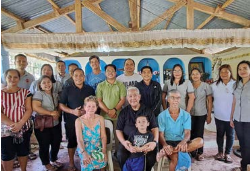
Above: At the Tabaco Port, taking a picture before traveling to Catanduanes; The parishioners of Bgy. Suchan

warmly received us and gave the assurance of their support. Some villagers from Barangay Suchan had pledged to donate a parcel of land for the future location of the parish church and rectory. Another family offered land to use as a Catholic cemetery.