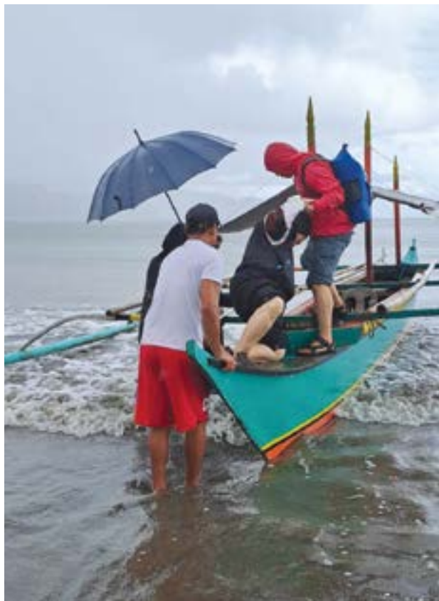
Above: Crossing Panay Island from Bagamanoc; The Bishop boarding a boat to cross the sea and travel to Panay Island.