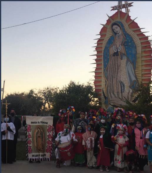
Above: Celebration for Our Lady of Guadalupe at St. Anthony's Catholic Church in Robstown, Texas.