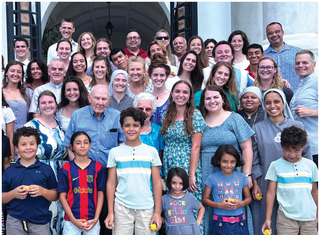
The SOLT team and missionary volunteers pose for a group picture on Easter.