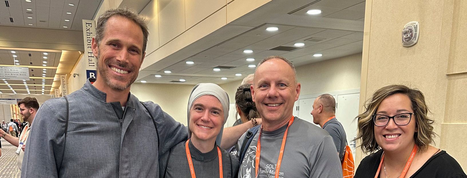
Above: SOLT Priests, Sisters and Laity hanging out by the exhibit hall.