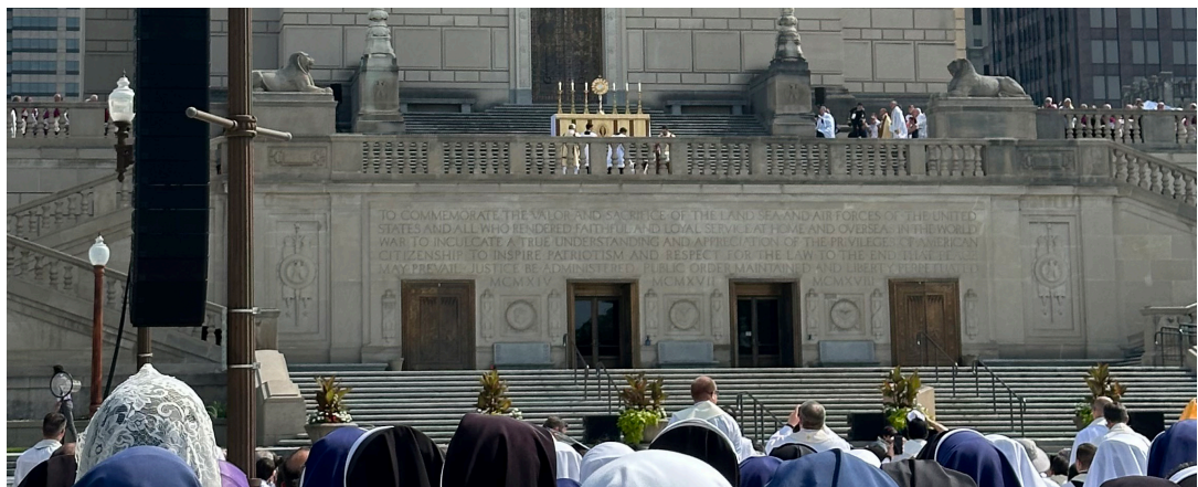
Thousands gather for adoration on the streets of Indianapolis.

The second point revolves around the offering which takes place at Mass. At the offertory, bread and wine are brought to the altar and the priest prepares the gifts for the offering. The rubric calls for the priest to raise the paten with bread and the chalice with wine just slightly above the altar. Moments later, following the