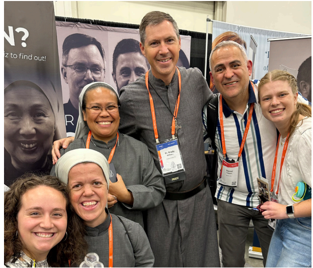
Hanging out at the SOLT booth with some friends.