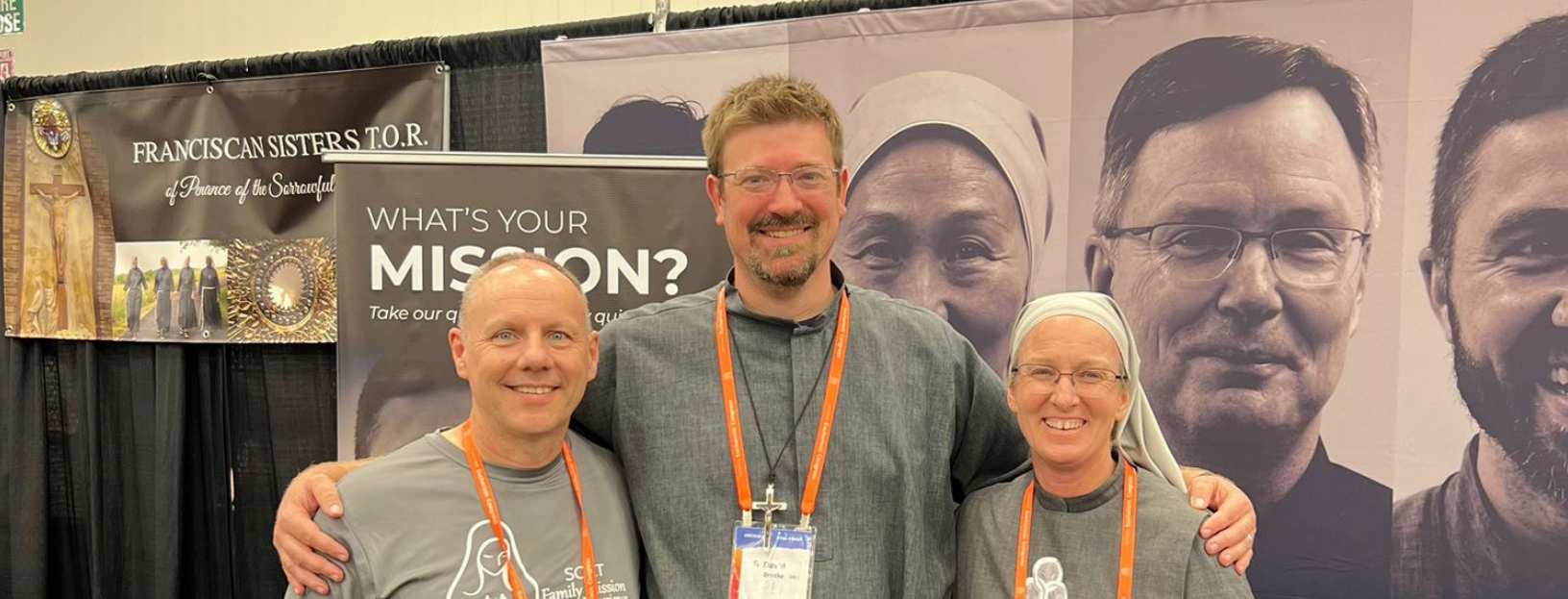
Above: The three SOLT Branches working together at the SOLT booth.

this revival also strengthens the missionary call of the laity. As members of a missionary community, SOLT Laity are often called to something deeper depending on their current circumstances, to seek out those who are hidden, lost, or forgotten, giving themselves in ministries and apostolates that are in need of people, resources, and energy. Energized by the model and companionship of Our Lady, they bring the love and truth of Christ to those who need Him most.