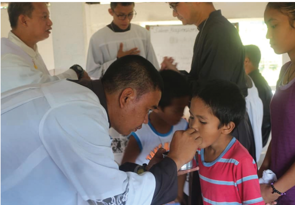
On the front cover: Prayer at a SOLT Asia-Pacific gathering.