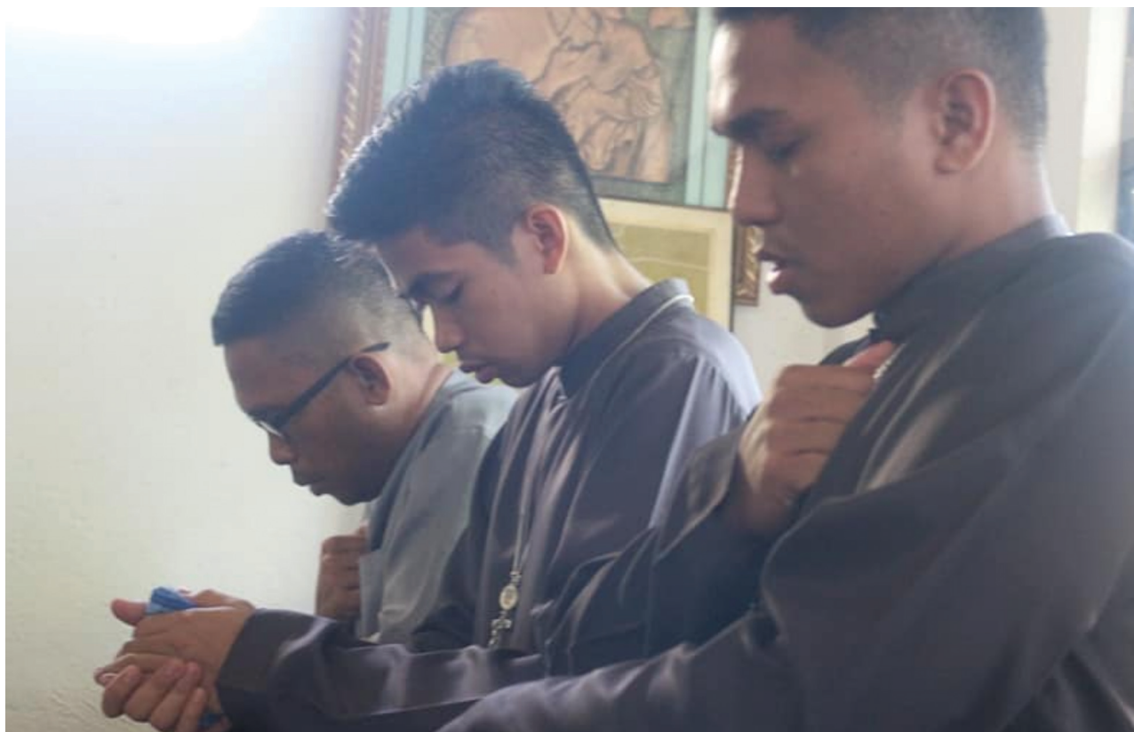
SOLT brothers and priests at prayer in the Philippines.

I was stunned and incredibly moved by the reception and outpouring of gratitude offered by the people of San Miguel. In particular, the little children offering their accented "thank you" made me feel entirely