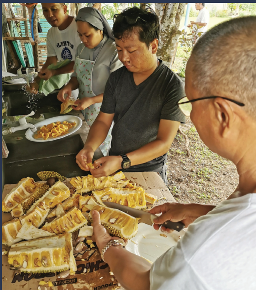
Above: SOLT Ecclesial Family Team prepares a meal at Our Lady of the Most Holy Trinity College Seminary.